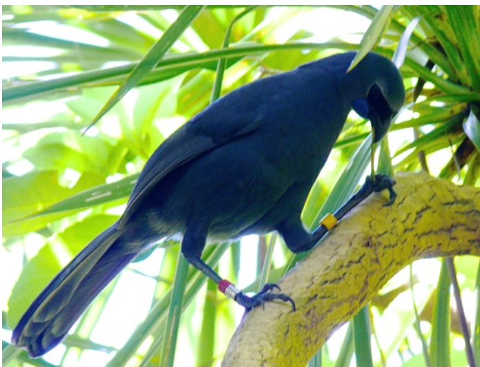
KOKAKO, NEW ZEALAND BY RICK TAYLOR