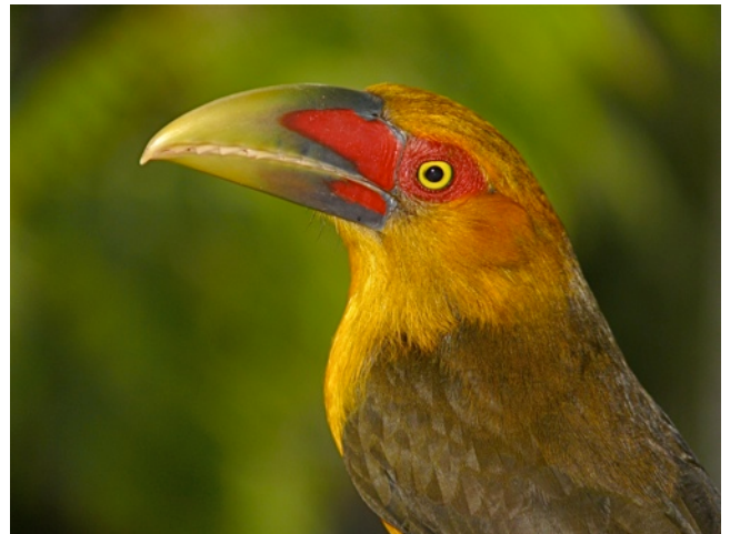
SAFFRON TOUCANET, BRAZIL BY RICK TAYLOR

BACK COVER PHOTO: BLUE-NAPED CHLOROPHONIA, SOUTHEAST BRAZIL BY RICK TAYLOR