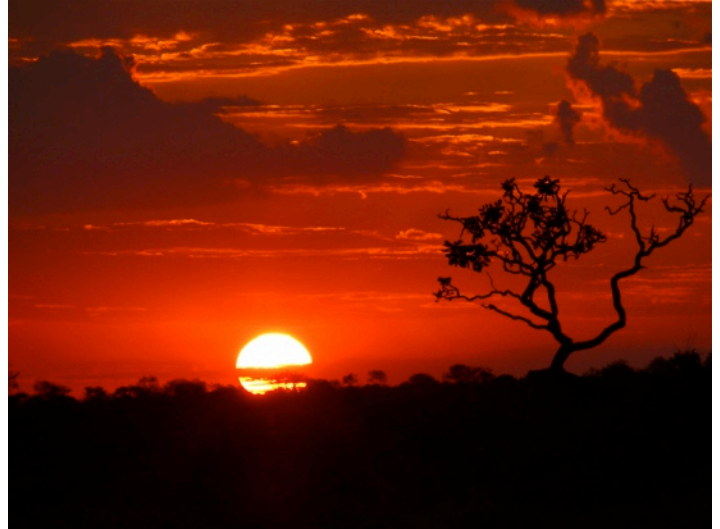
PANTANAL SUNSET, BRAZIL