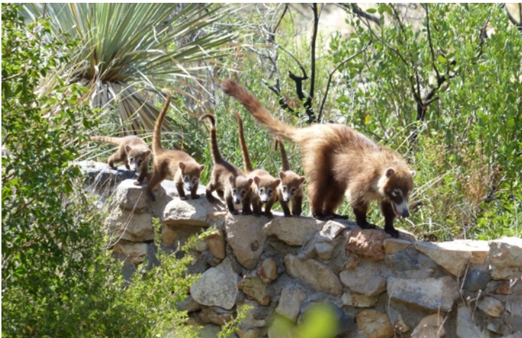
FAMILY OF COATI, WHITETAIL CANYON, ARIZONA