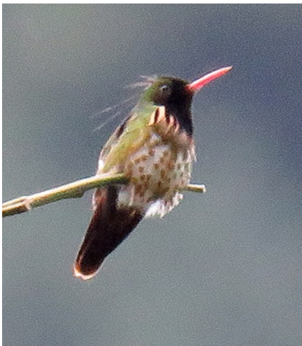
BLACK-CRESTED COQUETTE, HONDURAS