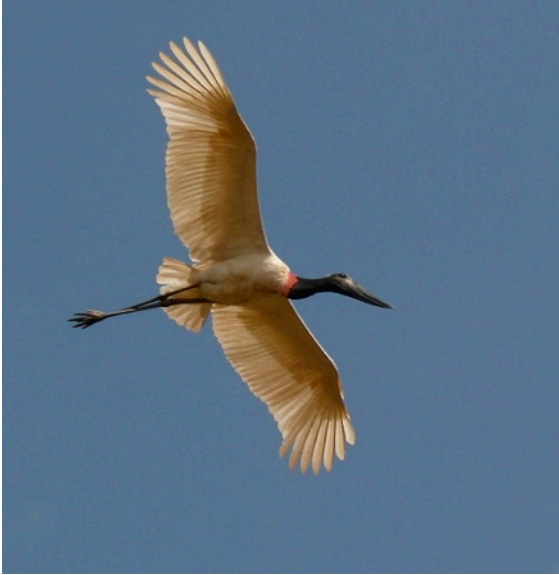
JABIRU IN FLIGHT, BRAZILIAN PANTANAL