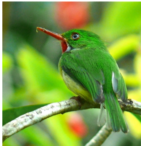
JAMAICAN TODY AT MARSHALL'S PEN