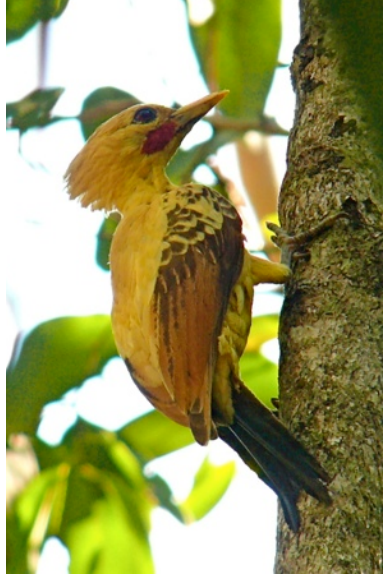
CREAM-COLORED WOODPECKER, IGUAZÚ