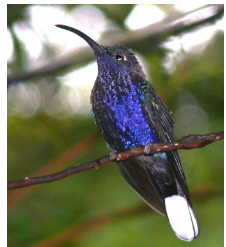
VIOLET SABREWING, COSTA RICA