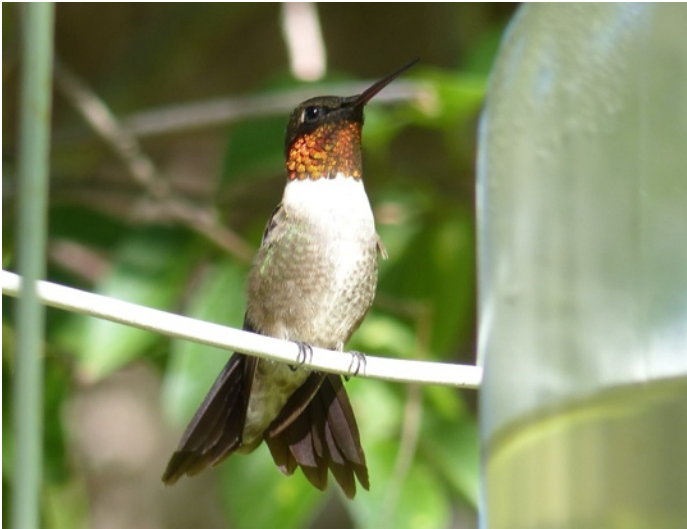
RUBY-THROATED HUMMINGBIRD, WHITETAIL CANYON 4 TH ARIZONA RECORD BY RICK TAYLOR